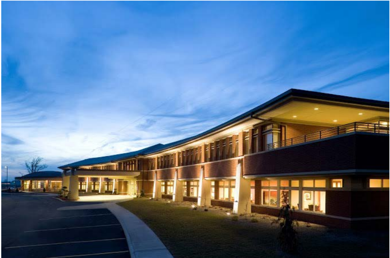
The Bellevue Hospital

Address: 1400 W Main St, Bellevue, OH 44811